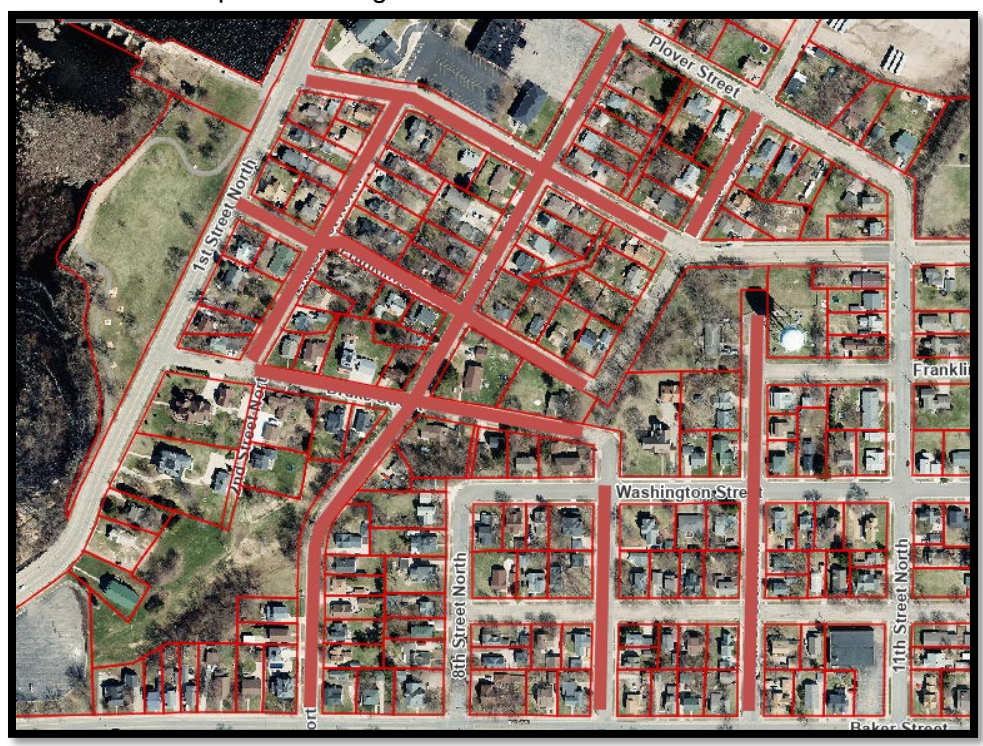
2024 Curb Maintenance Area

Restoration activities are expected to begin next week.